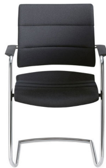
VC4 - 2 Visitor chair