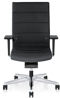
OC4 - 2 Office swivel chair