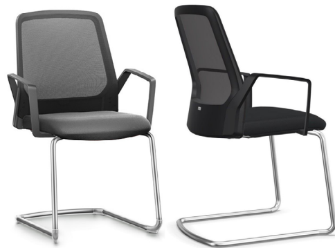
VC4 - 3M