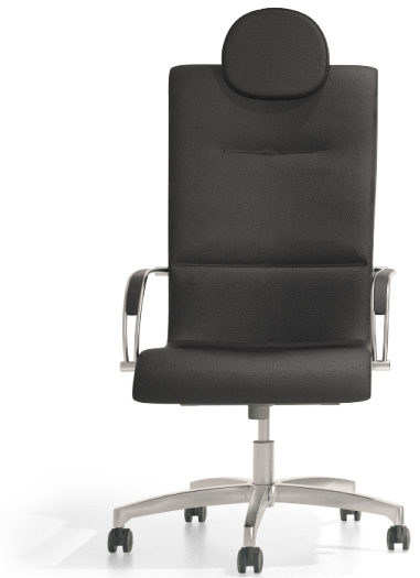
OC4 - 1T