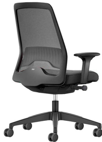
OC4 - 3M