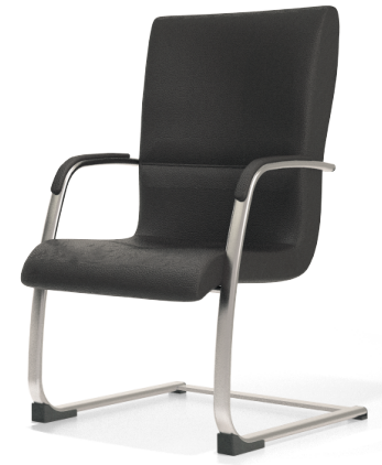
VC4 - 1