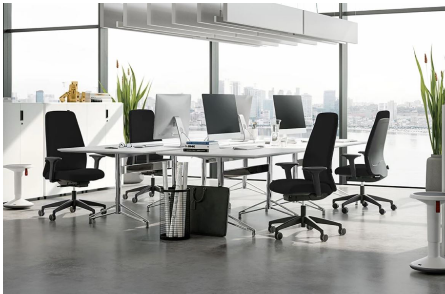
OC4 - 3.1